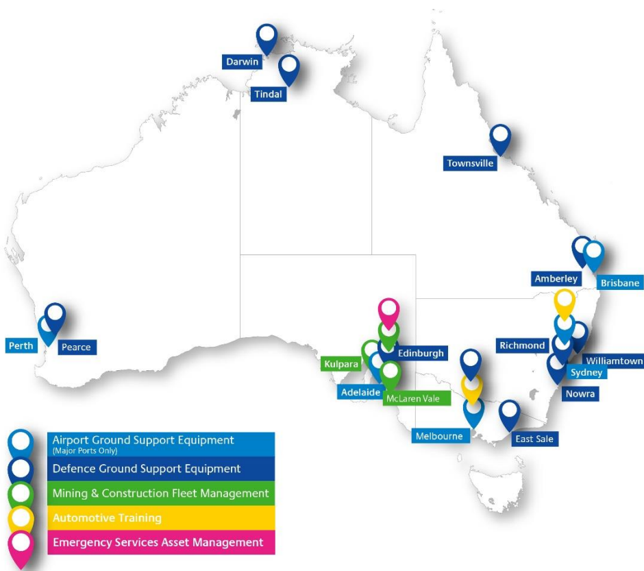
Figure 2 - Land operations map