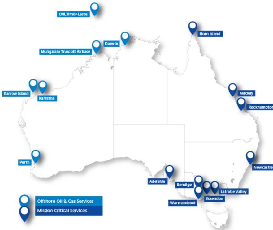
Figure 3 - Aviation operations map