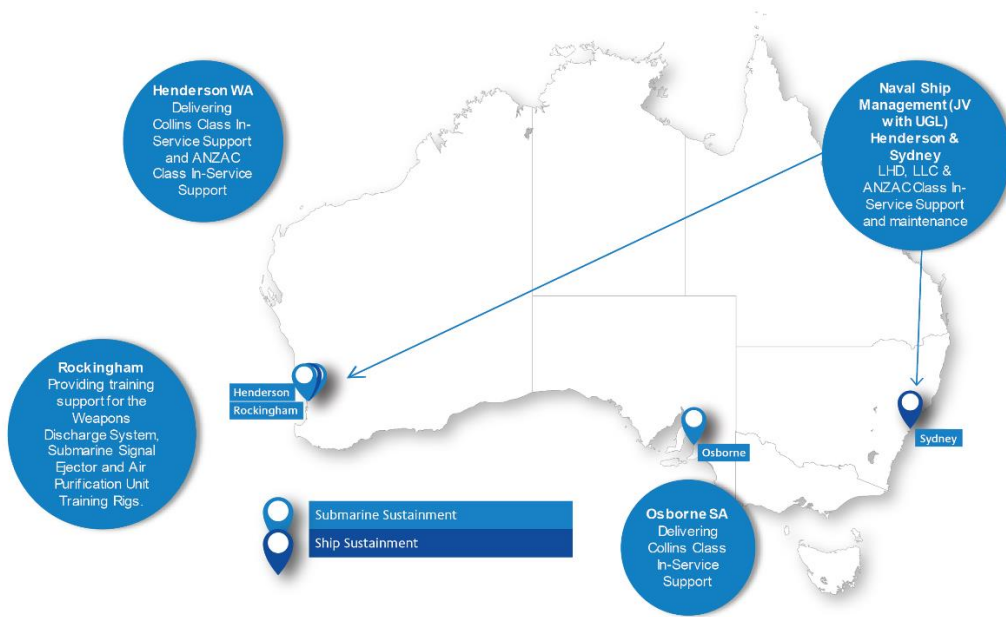
Figure 1 - Marine operations map