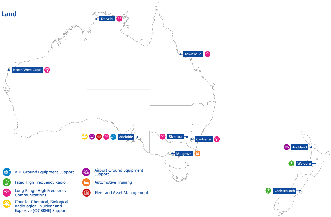
Figure 2 - Land operations map