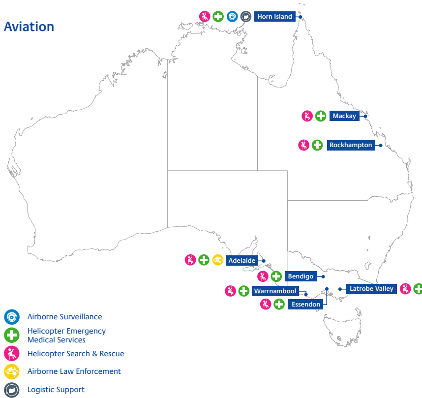
Figure 3 - Aviation operations map as at August 2022, following the sale of Babcock Offshore Services Australasia