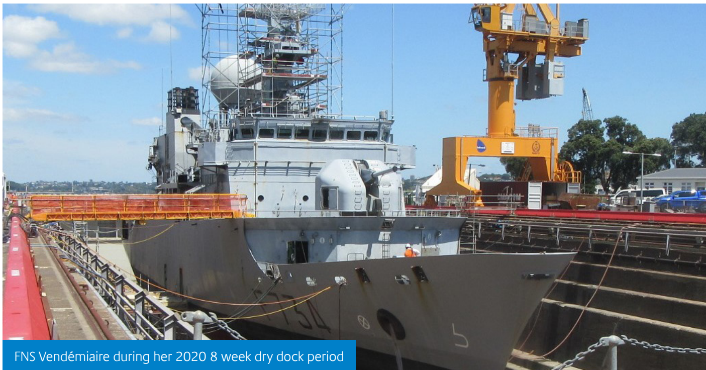
FNS Vendémiaire during her 2020 8 week dry dock period