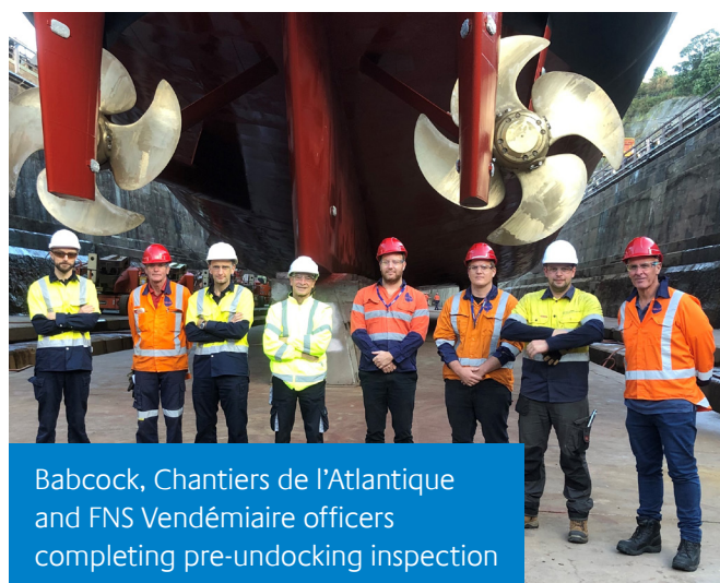
Babcock, Chantiers de l'Atlantique and FNS Vendémiaire officers completing pre-undocking inspection