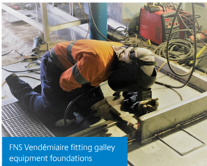
FNS Vendémiaire fitting galley equipment foundations