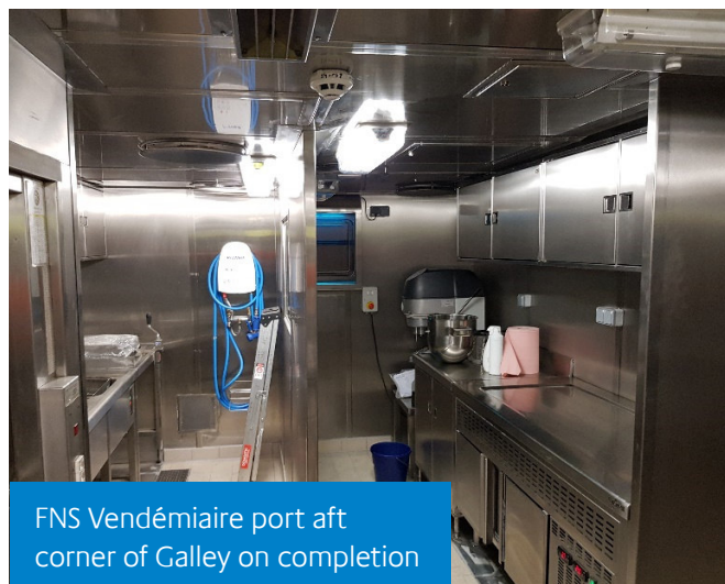
FNS Vendémiaire port aft corner of Galley on completion